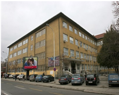
Figure 1: Faculty of Civil Engineering - Skopje

The Faculty of Civil Engineering - Skopje was founded in 1949, as a part of Technical Faculty that was formed from two departments - Civil engineering and Architecture.