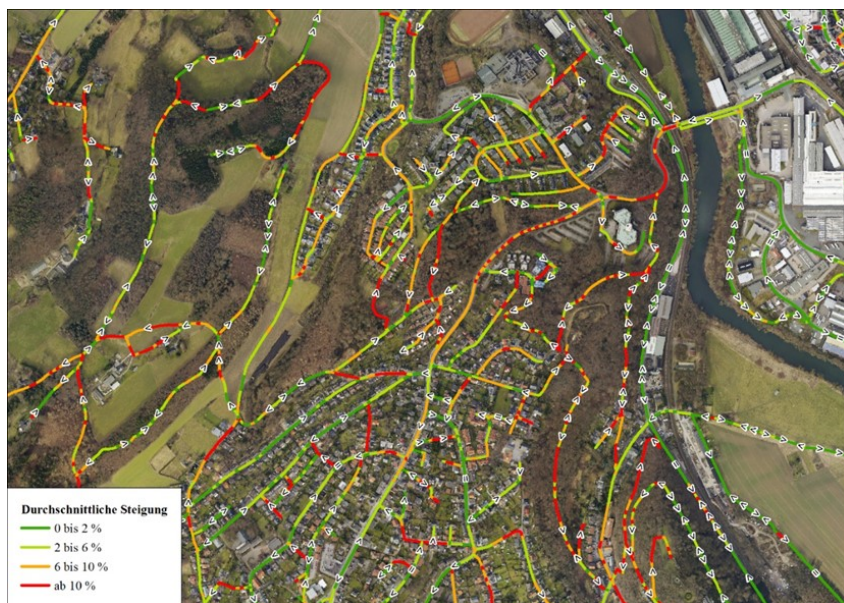
Figure 1: Average slope per street segment. Data: Digital Terrain Model, Digital Landscape Model, Digital Orthophotos. Data source: Land NRW (2017). Data licence Germany – attribution – Version 2.0

Since January 2017, all official spatial information of the German state North Rhine Westphalia is available as Open Data. Digital Terrain Models, Digital Landscape Models, Orthophotos and topographic maps, as well as the data concerning the population or the environment are ready to be downloaded in different formats and free to use for all academic, economic, governmental or other commercial or non-commercial purposes under the link http://opengeodata.nrw.de .